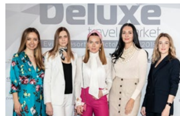
Deluxe Travel Market Europe at Evian Resort 2019