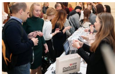
Deluxe Travel Market Ukraine, Kiev 2019