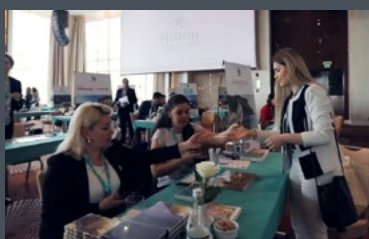
Baku Travel Bazaar