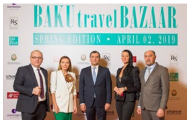
Baku Travel Bazaar Spring Edition, Baku 2019