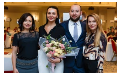
Deluxe Travel Market Kazakhstan, Almaty 2019