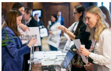
Deluxe Travel Market Belarus, Minsk 2019