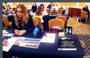
Deluxe Travel Market Ukraine